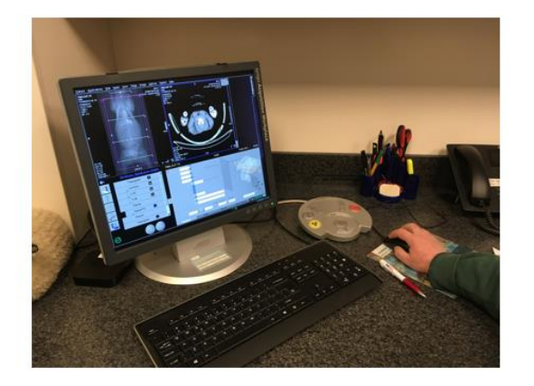
Az ideális izom-zsír arány kimutatására CT vizsgálatokat végeznek juhoknál szelekciós céllal. CT scans are performed on sheep for selection to determine the ideal muscle-to-fat ratio.