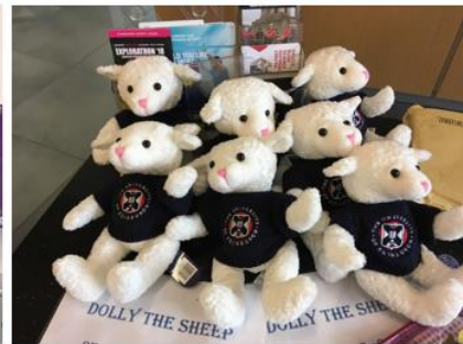
Szuvenír a bejáratnál Souvenir at the entrance