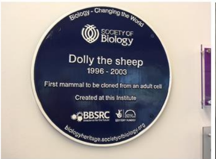
Dolly emléktáblája az egyetem falán Dolly plaque on the university wall