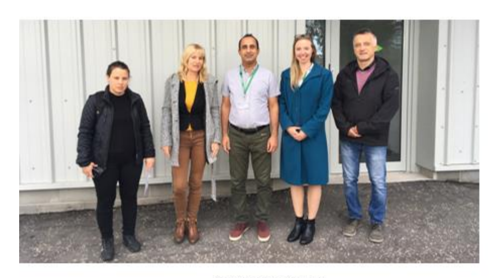
Skót kollégákkal With Scottish colleagues